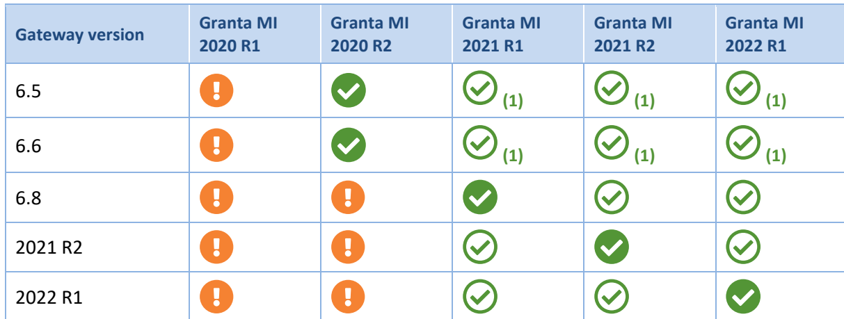
Table 2: Supported combinations of Gateway releases and Granta MI versions

The table below shows the MI Materials Gateway releases that are compatible with recent versions of Granta MI. If you require information about an earlier version of Gateway and/or Granta MI, contact Granta Support.